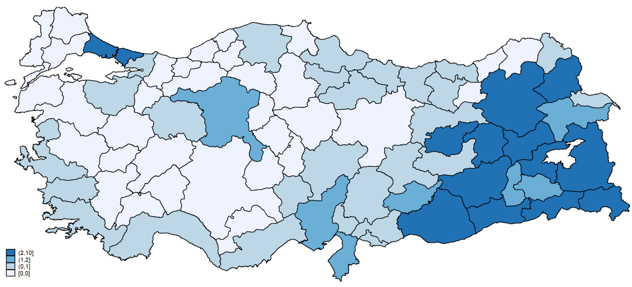
Figure 1: Spatial distribution of average terror index, 2010–2013.